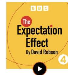
The Expectation Effect by David Robson The Super-Agers

My most recent encounter that has captured my fascination is one called 'The Expectation Effect', these are 8 episodes of 15 minutes. Each episode is self contained, and covers a different aspect of the topic. The most simplistic explanation would be that if unwittingly you take a tablet that is a placebo - you "expect" it to work, and because you expected it to work, it did, even though the tablet was just a "blank". Other subjects covered are: 'How our minds can effect our waistlines?', 'Are you really as young-or-old as you feel?' and 'How do our beliefs shape our reality?' I recommend that you download the BBC Sounds App to your smart phone/iPad/tablet and go to the Books section and have a listen - It gets the mind buzzing.